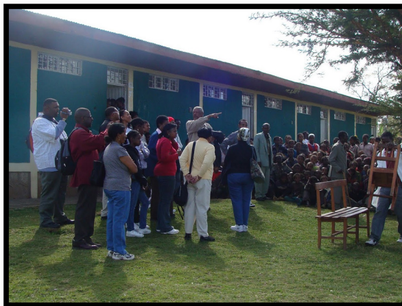
Ancha new school building

Ethiopian Mission-Hands Across the Sea- (Locally the Uptown church of Christ Mission) used to have two schools with over 1,000 students with over fifty workers (teachers and support staff including the official workers). At the present time the government of Ethiopia closed one of our schools in Addis Ababa for not meeting the government's standard. However, our school at Ancha is still open and functioning. Please pray and help us to reopen our closed school in Addis Ababa by meeting the Ethiopian government standards.