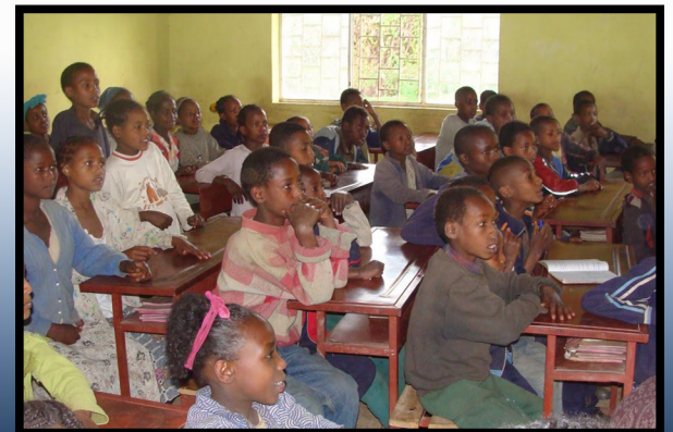
Ancha School in Kembata