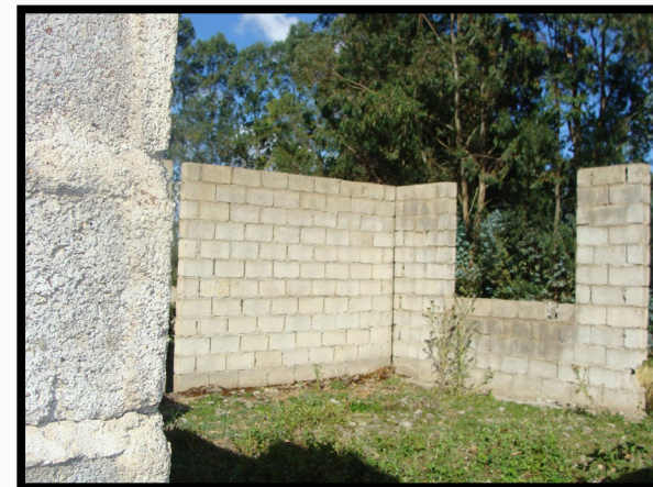
Incomplete school foundation